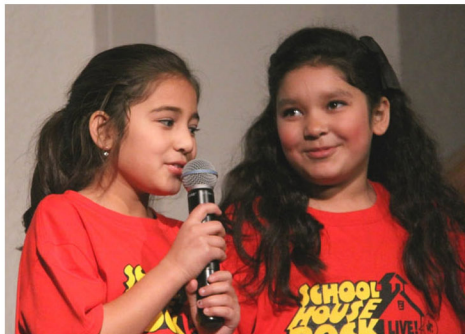
First Show: School House Rock, KIDS, 2013