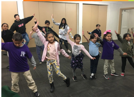
Pico Union students rehearse for their pre-show opening number performance for South Bay's Fall Musical