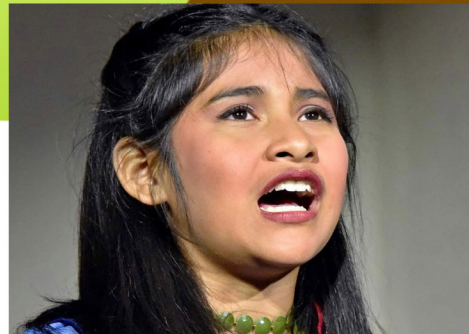
Pico Union's 2019 Spring Musical: Disney's Mulan Jr.